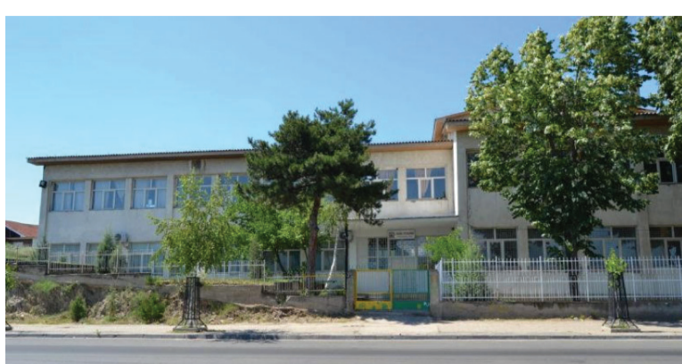
Kocani, REPUBLIC OF NORTH MACEDONIA