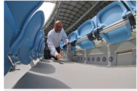
The world cup 2022 in Qatar

Like any human activity, sport takes place in a physical environment, therefore it is impacted by climate change. There is an interconnectedness between climate change and sports, where sport can even have a significant negative impact on the environment, although this impact may not be always obvious and easily detected. It is essential for sports organizations, engaged both in outdoor and indoor sports activities, to think about the relationship between sport and the environment and work towards becoming sustainable and environmentally friendly.