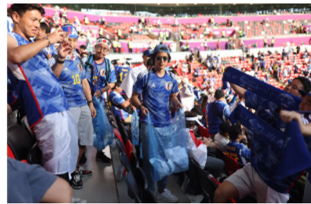
The world cup 2022 in Qatar

Organizing the World cup in the desert has a significant environmental impact. The higher temperature created the need for cooling of the stadiums and increasing energy consumption